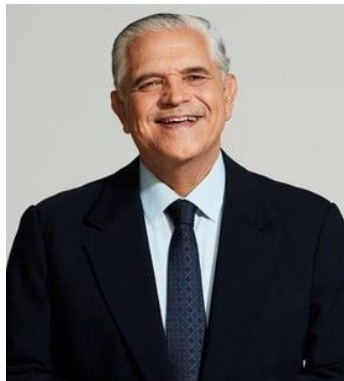
Ricardo López Murphy

You can register for this seminar by clicking here .